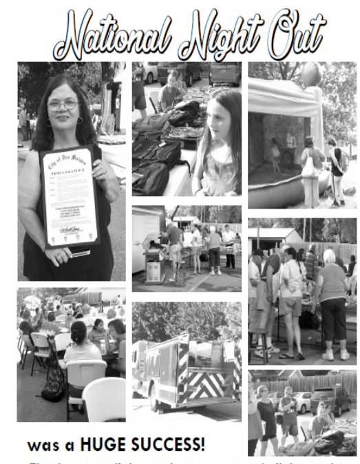
Thank you to all those who came out and all those who volunteered to make this event so wonderful rewarding!

National Night Out (NNO) is a big deal in most of the organized neighborhoods in Des Moines. NNO is America's celebration against crime. We in the Union Park Neighborhood, are extremely fortunate that the Union Park United Methodist Church steps up each year with their volunteers and organization skills to sponsor National Night out in the Union Park Neighborhood. Again, NNO was celebrated August 2nd at the Church parking lot. They offered free food, games, lively music, and entertainment. Des Moines Fire and Police representatives and community partners stopped by that night to say hello. NNO was combined with a "Back to School Party" and about 80 free backpacks with school supplies were provided to children on a first come first serve basis. The event was well attended and a huge success. Thank you to the good people at the Union Park United Methodist Church!