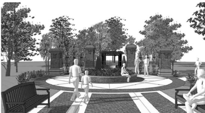
Union Park Monument Sign

We have also submitted a Community Development Grant application to Polk County Board of Supervisors for some additional work at the Union Park entrance. This one is for $19,800 and would allow us to complete a major portion of the work depicted in the Confluence design. We expect to know whether we receive this grant by the end of July. Expect to see some construction activity in that corner of the park by this fall.