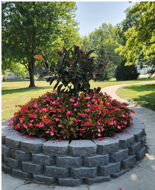
Flower bed in Union Park

For questions, contact Public Works 24/7 at 515-283-4950