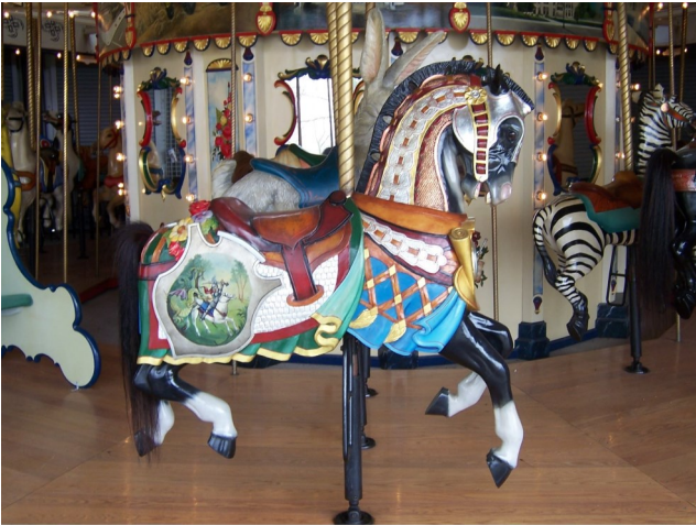
LEAD HORSE (Row 5, Outside) "McFarland" Adopted by Union Park Neighborhood Association