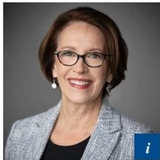
CONNIE BOESEN MAYOR